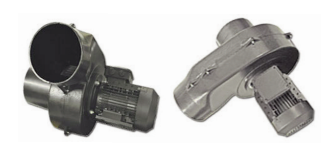
[Please note - image above may not be representative of the unit supplied]